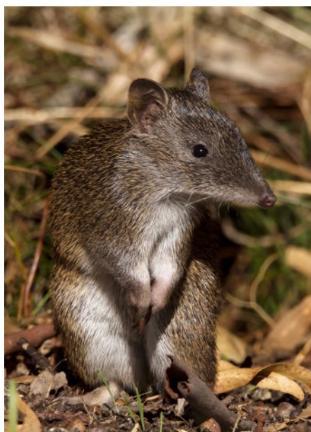
Quenda photo courtesy of Jesse Steele.

Survival can be a tough gig for our local wildlife as they contend with drought, fire, limited availability of food and water and the ever present risk of injury and death from pets and vehicles.