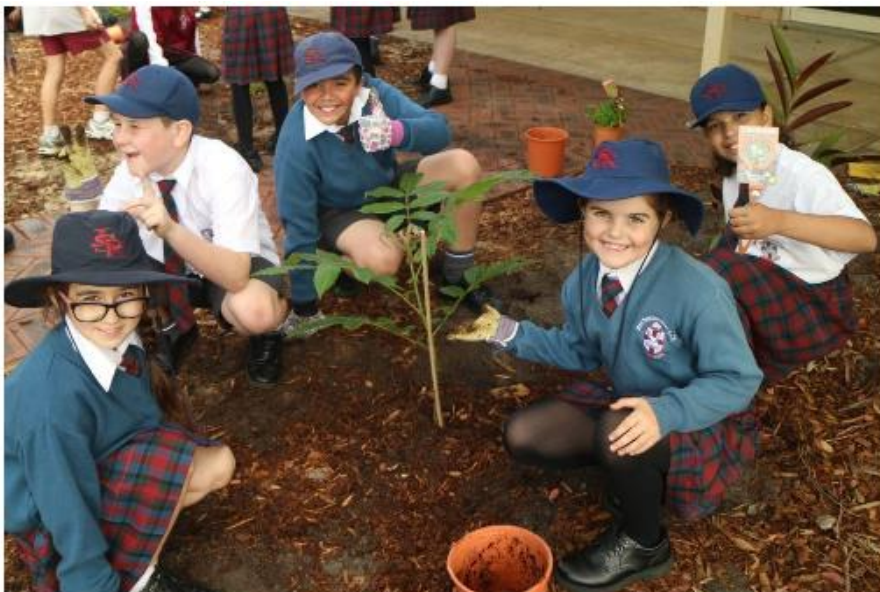
Image: Bush tucker planting