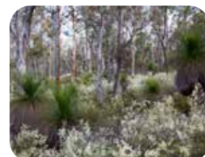
Xanthorrhoea preissii (Grass Tree/Balga)