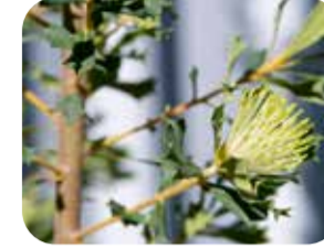
Banksia sessilis (Parrot Bush)