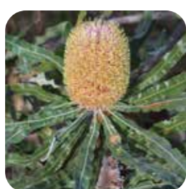
Banksia grandis (Bull banksia)