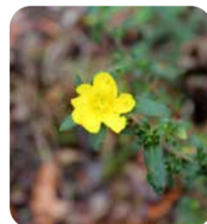
Hibbertia hypericoides (Native buttercup)