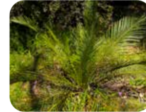
Macrozamia riedlei (Zamia palm)