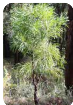
Persoonia longifolia (Snotty Gobble)