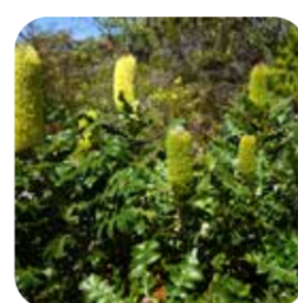
Banksia littoralis (Swamp banksia)