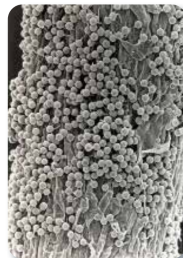
Phytophthora spores attacking plant roots

The microscopic spores of Phytophthora cinnamomi spread through water, soil and root-to-root contact between plants. They can spread about one metre per year in root-to-root contact. In sloping areas, it can spread more quickly downhill in surface and sub-surface water flow.