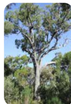
Eucalyptus marginata (Jarrah)