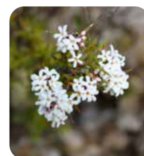
Leucopogon capitellatus (Beard Heath)